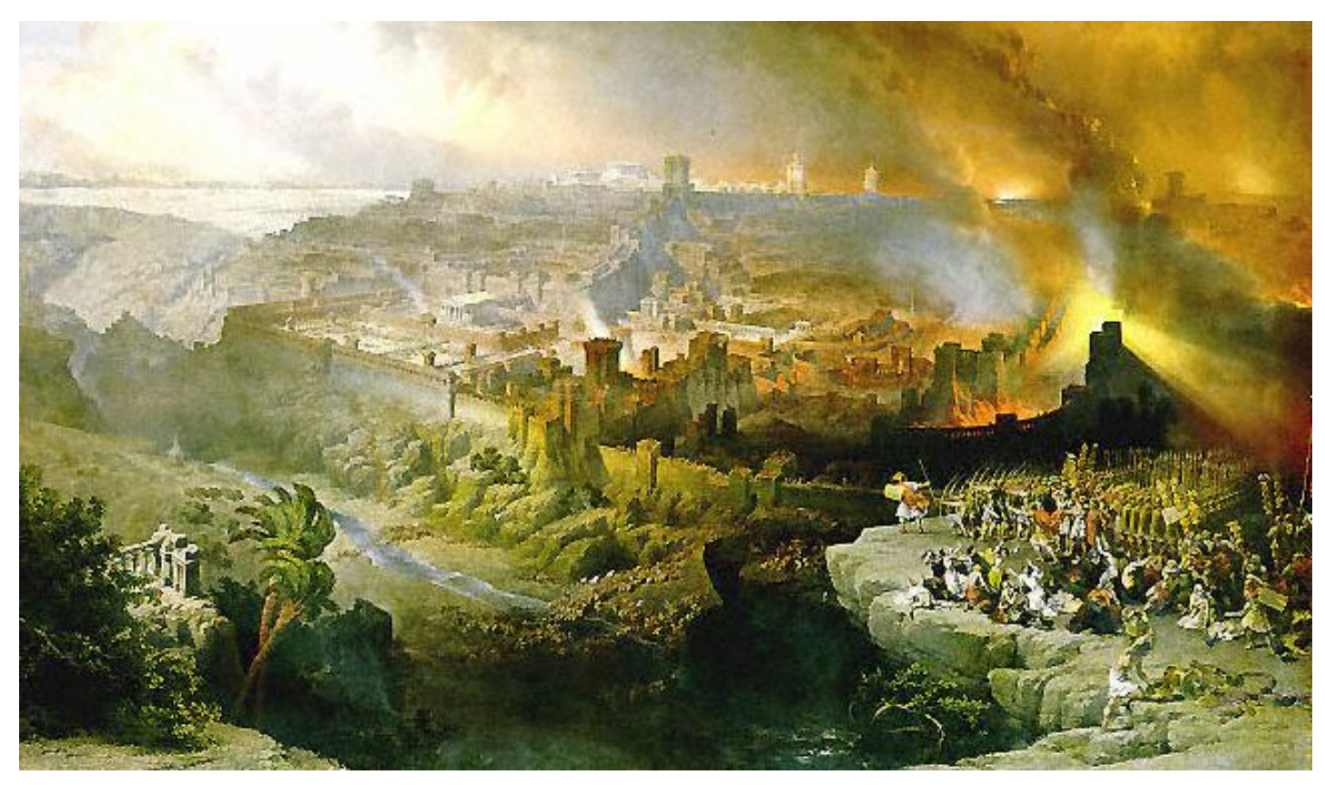
Siege of Jerusalem (70) The destruction date according to the Hebrew calendar was the 9th of Av, also known as Tisha B'Av (29 or 30 July 70).

Josephus claims that 1,100,000 people were killed during the siege, of which a majority were Jewish, and that 97,000 were captured and enslaved. . .